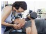
10 romantic sports for Valentine's Day