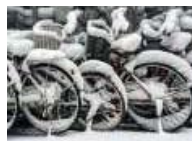
Japan's heaviest snowstorm in 45 years