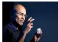
Indians in the business big league