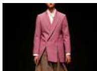
"Girly" fashion trends catching on with men