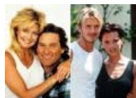
Valentine's Day: long-term celebrity couples