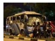
No offence committed for Little India riot driver