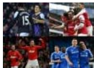
2013/14 BPL mid-season review: Your favourite clubs