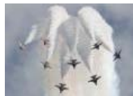
What to expect at the Singapore Airshow