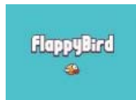
Best Flappy Bird alternative games