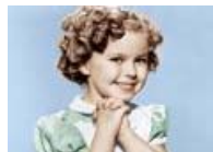
Shirley Temple: a life in pictures